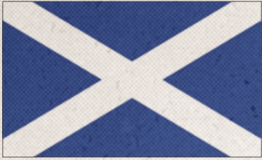
The Saltire (St Andrew's Cross), the national flag of Scotland.