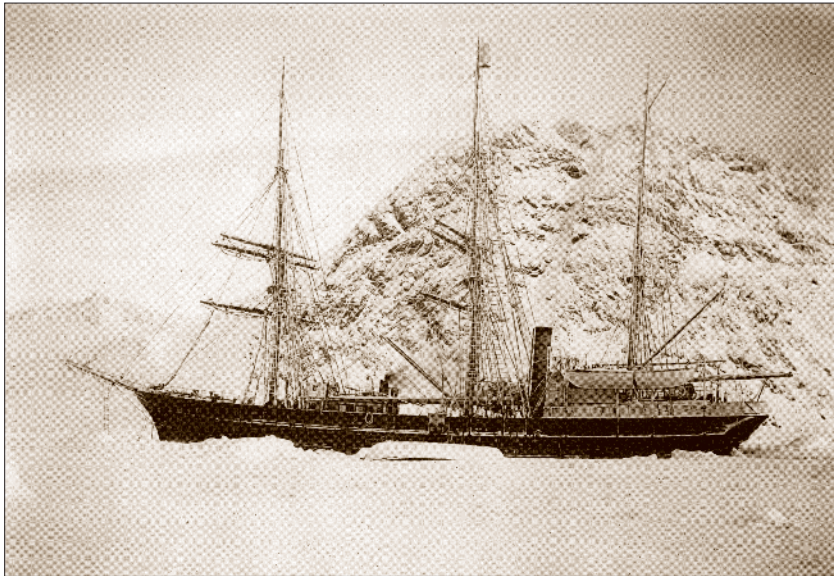
SY Scotia in the South Orkneys.