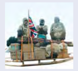
Antarctic Adventurers appearing during the Shackleton Autumn School