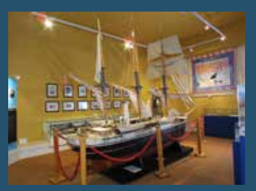
Scale model of the Endurance in Athy Heritage Centre - Museum